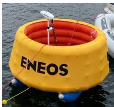
Mark 1 and 2